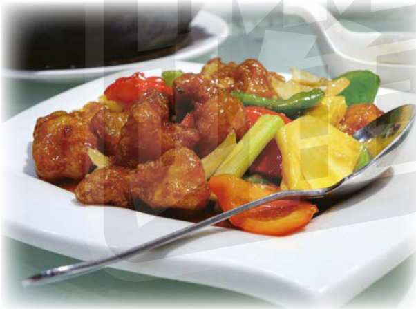
Sweet and sour pork